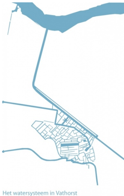
Het watersysteem in Vathorst

The site Vathorst is situated on the east side of the A1 highway that forms the border to the last suburban extensions of the city of Amersfoort. West 8 together with Kuiper Compagnons made a masterplan for this Vinex site. The plan contains 11000 dwellings, 90 hectare of commercial, industrial and office programs and its required public facilities.